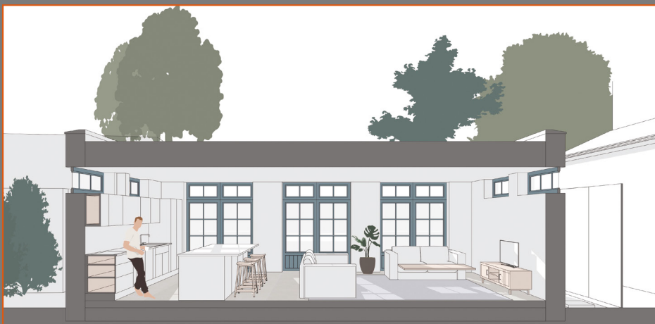
West Sussex design response

His passion for the built heritage environment is evident in projects ranging from his award-nominated university work on historic terraced housing to international archaeological collaboration in Sardinia and his ongoing conservation-focused work across West Sussex.